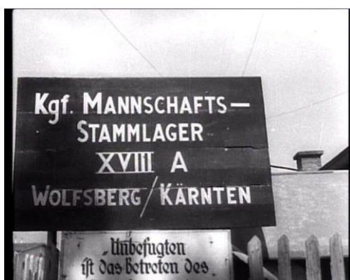
Welcome to Wolfsberg

2 First contacted the 8 th Army on the 8 th of May. Walk into Villach from camp 9 kilometers and meet the Grenadier Guards.